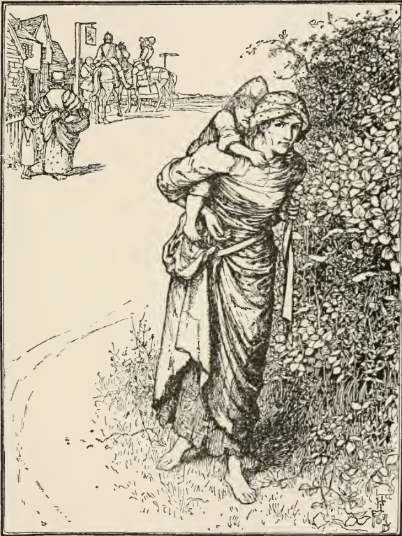
Lady Dalkeith's journey to Dover

them to Paris, and found there that she was almost as much a heroine as Henrietta Maria. But, indeed, misfortune only appeared to have doubled their friends, and everyone at court tried to see how much kindness they could